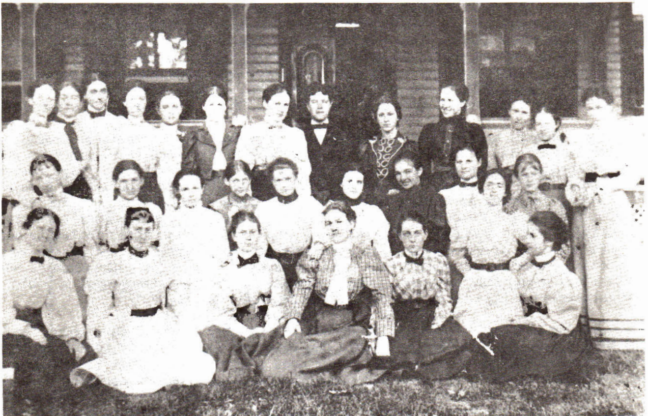
Students and Teachers, Briarley Hall Seminary, 1897