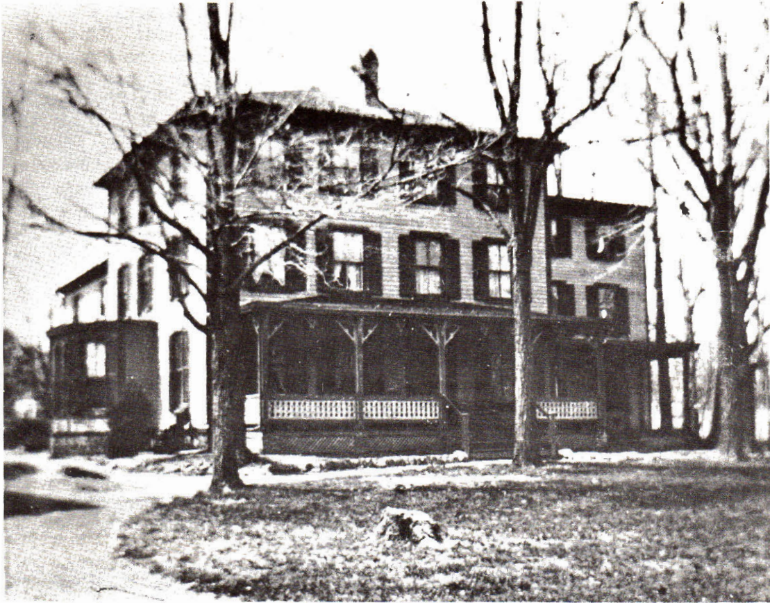
Briarley Hall Seminary, circa 1905

Military Academy at Cornwall-on-the-Hudson. 19 Perhaps it was on this visit that he began to dream of his own school at Briarley Hall.