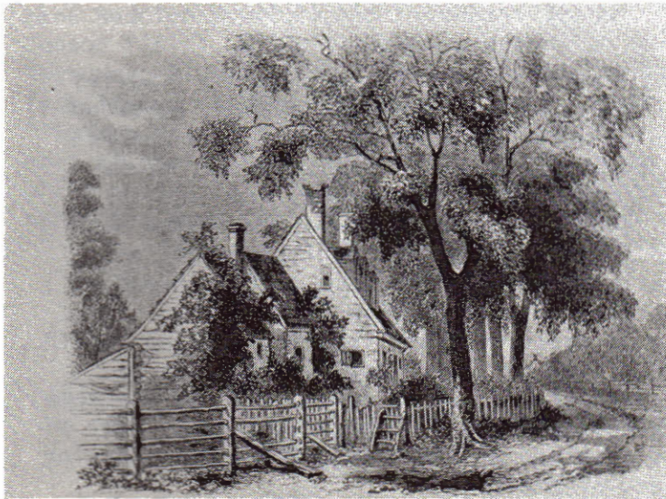
Richard Beall House, As Sketched by Porte Crayon