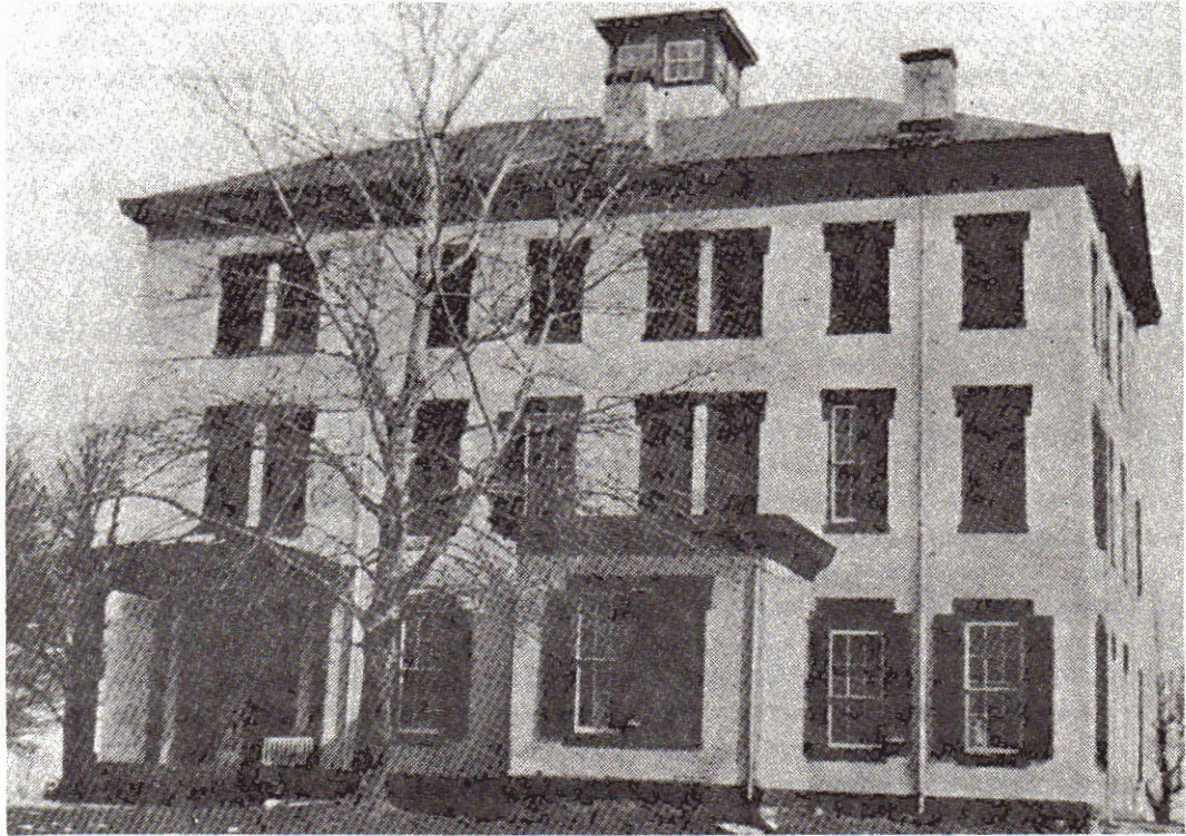
Andrew Small Academy

In 1907, the Academy was closed, and the Montgomery County Board of Commissioners of Public Schools took over the building as part of the county public high-school system. The trustees of the Andrew Small Academy continued to maintain the building and to pay a part of the principal's salary. In 1927, after 20 years as a three-year public high school, the county converted the building to an elementary school, using only the bottom floor for grades 1 through 6.